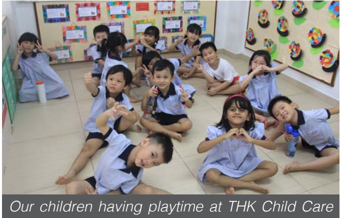
Centre @ MacPherson.

THK Child Care and Student Care Centres adopt the Integrated Thematic Curriculum, which capitalises on children's interests, creating a sense of purpose and community in the classroom. By building on their curiosity and life experiences, young children's attitudes, skills and knowledge are developed in meaningful ways.