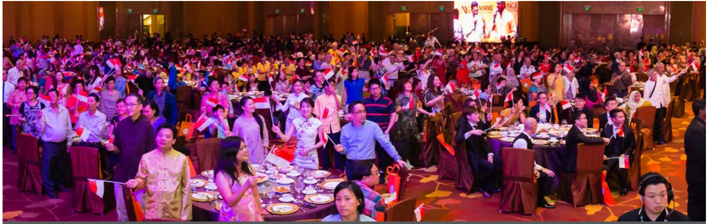
More than 2,200 guests attended the Inter Racial Inter Religious Harmony Nite 2015 at Marina Bay Sands Grand Ballroom

A total of 78,500 paper butterflies were collected and displayed at the dinner event and successfully set the record for the Largest Display of Paper Butterflies in the Singapore Book of Records.