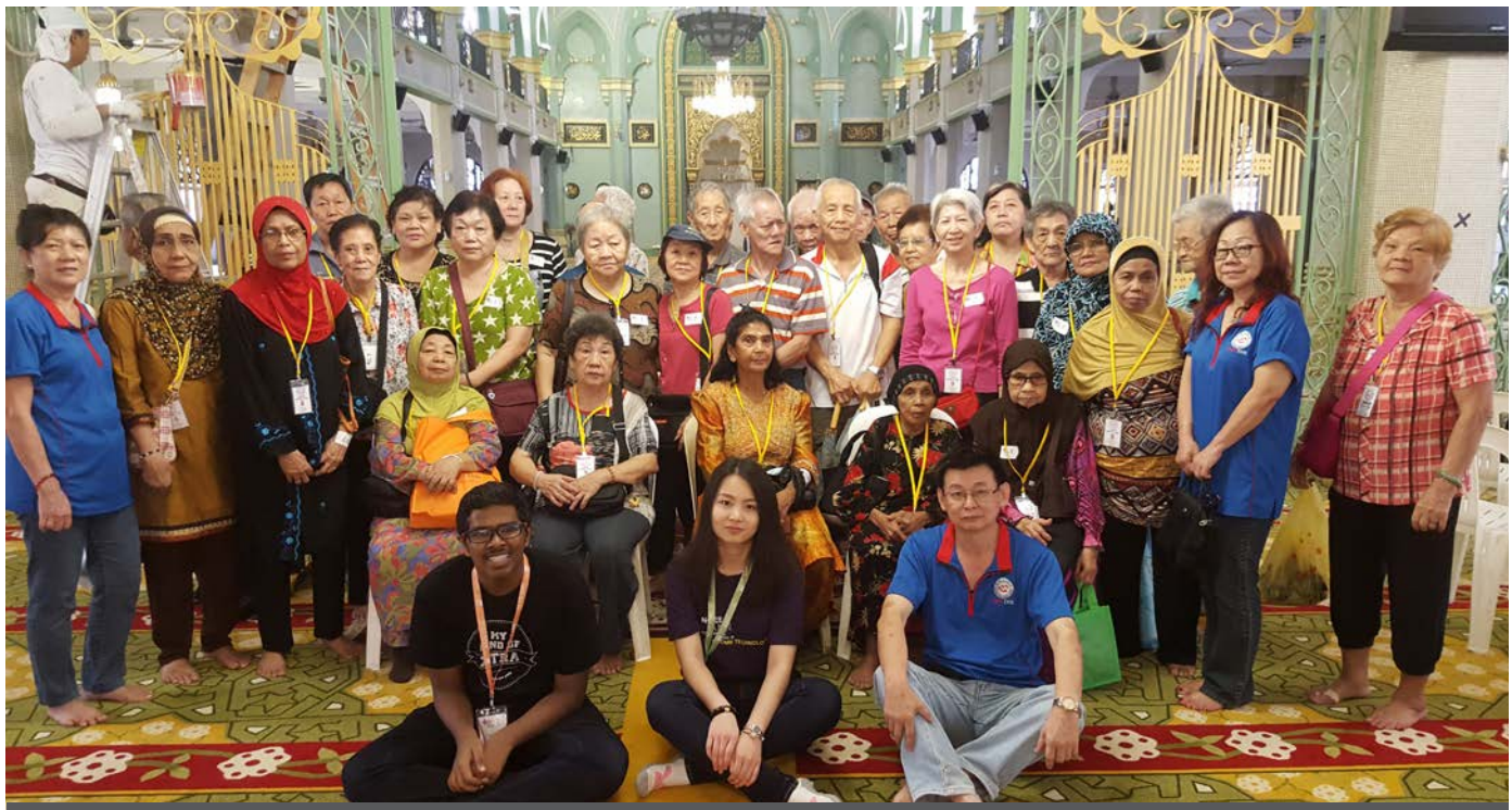
Participants visited the Sultan Mosque as part of the SG50 Harmony Road Trip

The places of worship for the SG50 Harmony Road Trip included Chinese temples, mosques, Hindu temples as well as churches. They were namely, the Thian Hock Keng Temple, Hong San See Temple, Yueh Hai Ching Temple, Sultan Mosque, Al-Abrar Mosque, Jamae Mosque, Sri Mariamman Temple, Sri Thendayuthapani Temple, Sri Srinivasa Perumal Temple, St. Joseph's Church and Telok Ayer Chinese Methodist Church.