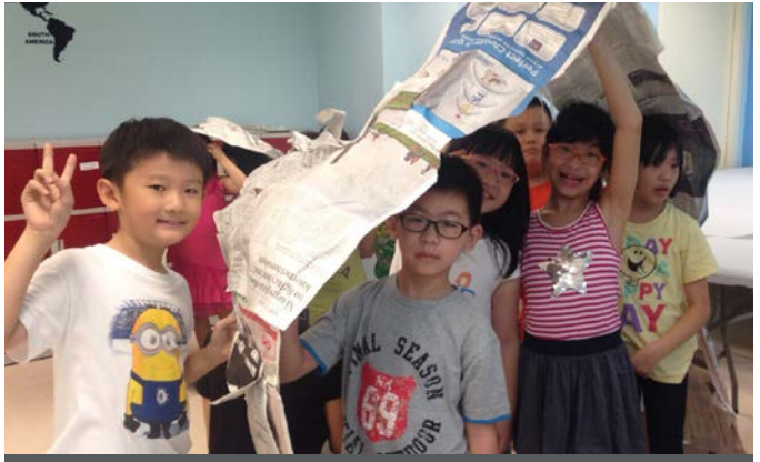
THK Student Care Centre @ Punggol Walk began operations in December 2015

THK Student Care Centre @ Punggol Walk welcomed its inaugural batch of students aged 7 years (Primary 1) to 14 years (Secondary 2) in December 2015. The new centre helps to serve young families in the neighbourhood by offering a conducive environment for the child's development by through supervised study, play activities as well as enrichment or recreational programmes.