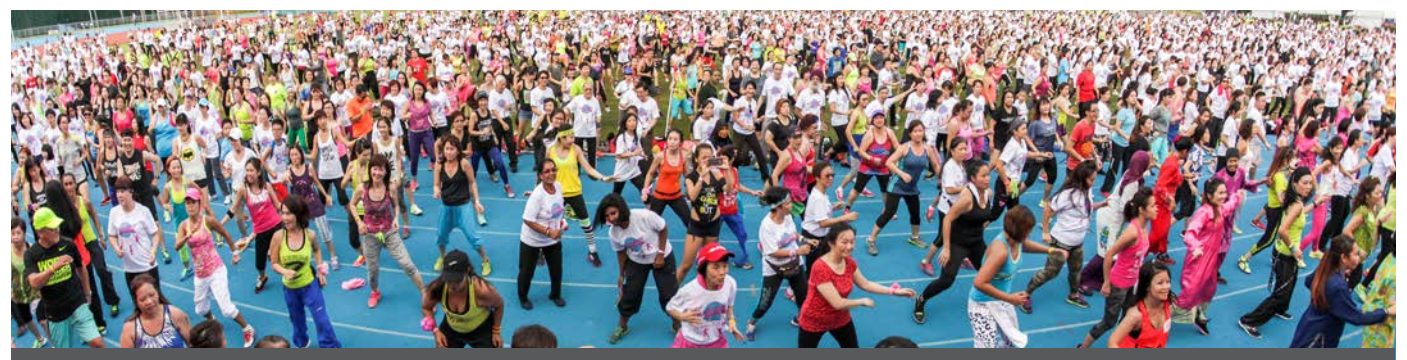
More than 5,500 participants attended the SG50 Harmony Swing at Nanyang Polytechnic

The carnival-themed event was graced by then Minister for Education and Chairman of SG50 Steering Committee, Mr Heng Swee Keat. The young and old also took part in traditional games that many Singaporeans grew up with.