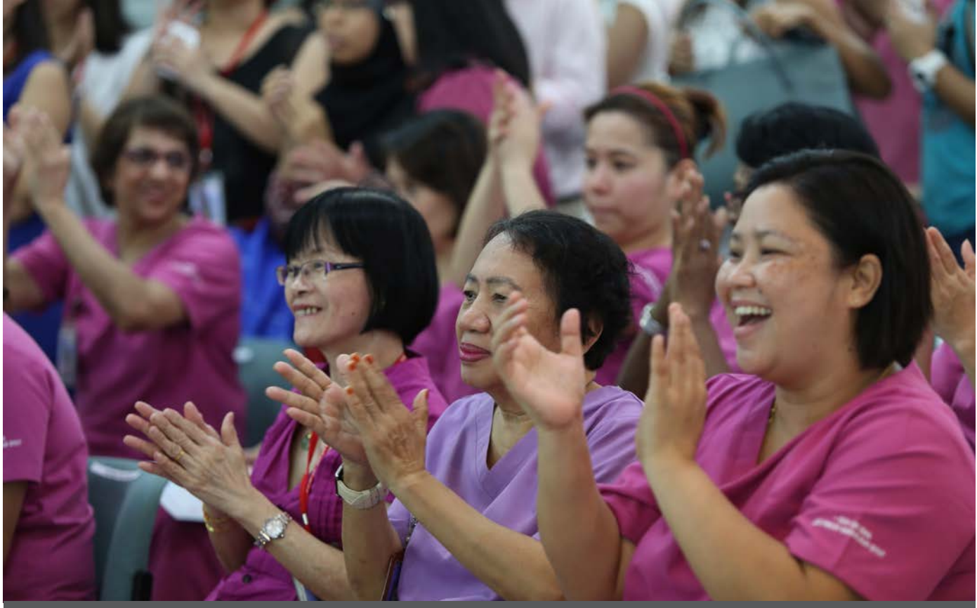
Nurses enjoying a performance during the hospital's Nurses' Day celebrations

their chronic diseases and vaccinations, the patients are less likely to re-visit the emergency department within 28 days after discharge from AMK - THKH. As of September 2015, only 3% of the 2,769 patients enrolled in this programme were re-admitted within 28 days.