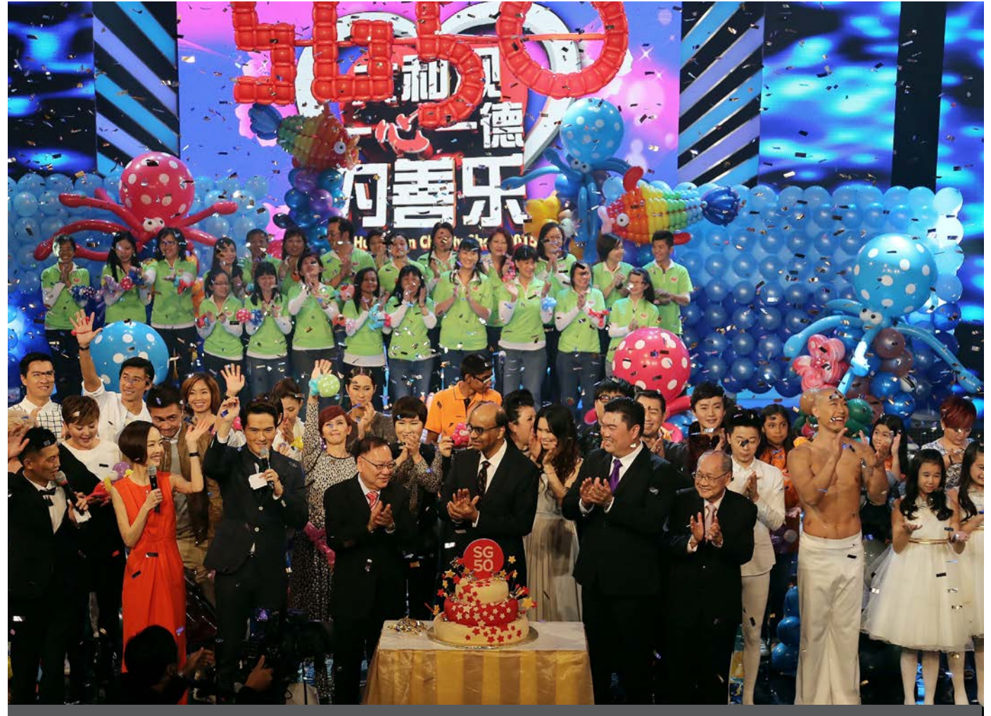
The grand finale during the live telecast of Thye Hua Kwan Charity Show 2015

Thye Hua Kwan Charity Show 2015 raised $5.5million through a live telecast on Mediacorp Channel 8 on 4 January 2015 with the tremendous support from our corporate partners, volunteers and members of the public. The theme for this year's event is, "Bring your festive joy to them". Deputy Prime Minister and Minister for Finance Tharman Shanmugaratnam graced was the Guest-of-Honour.