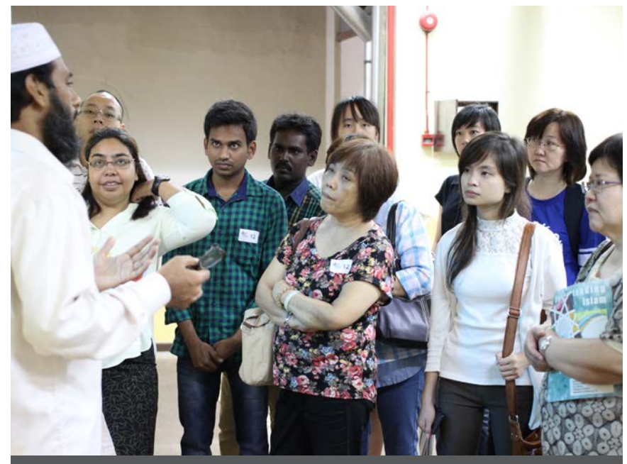
The Imam speaking to the participants during their visit to the AI-Abrar Mosque

The SG50 Harmony Road Trip aimed to advocate racial and religious understanding among Singaporeans by offering insight into the beliefs and practices of various religions. The event also fostered multicultural and intergenerational interaction amongst the young and the old and