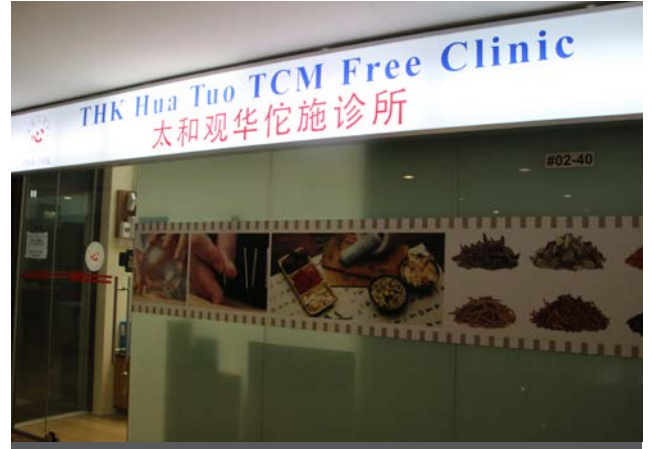
THK Hua Tuo TCM FREE CLINIC situated at North Bridge Road provides free TCM consultation to the public

THKMS offers medical services for the community by running several clinics, namely the Moral Free Clinic (Western) located within THK Family Service Centre @ MacPherson. The free Traditional Chinese Medicine (TCM) clinics are located at Taman Jurong as well as North Bridge Road.